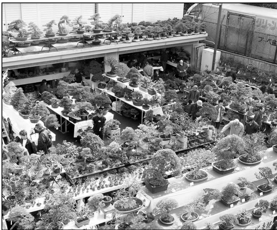
At the outdoor sales area of the Ueno Green Club bonsai, prebonsai, containers, tools, soil and seeds can be found for sale. Note many of the large size bonsai on the roof are sold as bare-root specimens.

Juniper bonsai being airlayered at the bonsai garden of Masahiko Kimura where training techniques can easily be studied.