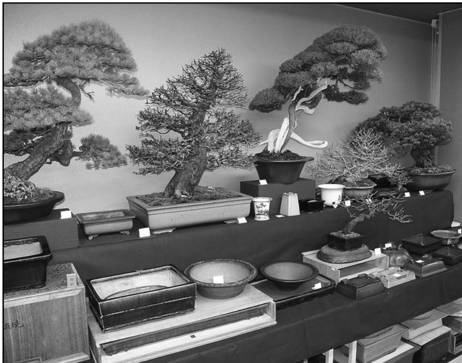
The three floors of the Ueno Green Club are full of masterpiece bonsai, antique containers, books, tools, suiseki, scrolls and other artifacts for bonsai creation and enjoyment.